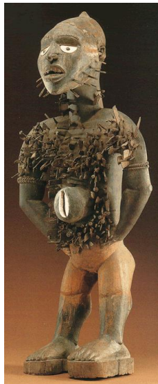
Kongo Nkisi Democratic Republic of Congo, 1875-1900

This is an example of a power figure, or nkisi . Nkisi contain sacred substances which are activated by supernatural forces to release spiritual forces into the physical world. The Kongo culture has a long tradition of using wooden sculptures to gain spiritual control over evil spirits and everyday problems, such as illness.