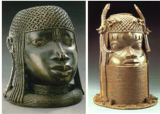
Portrait Heads of Benin Obas, early 1500s & 1897

The city of Benin arose from Ife about 150 miles to the southeast. The Benin culture became distinctly separate from Ife around 1170 CE.