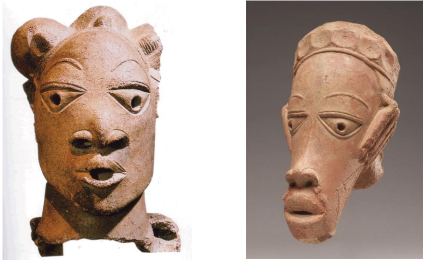
(Nok, western Sudan – modern day Nigeria 500-200 BCE)

The Nok culture that dates to around 500 BCE to 200 CE. The name “Nok” comes from a village near the place where the sculptures were found after they were washed away from their original contexts by the flooding of the Niger and Benue rivers. Most of the examples of Nok sculpture are human and animal forms. Although they are highly individualized, they are characterized by their distinctive “D” shaped eyes.