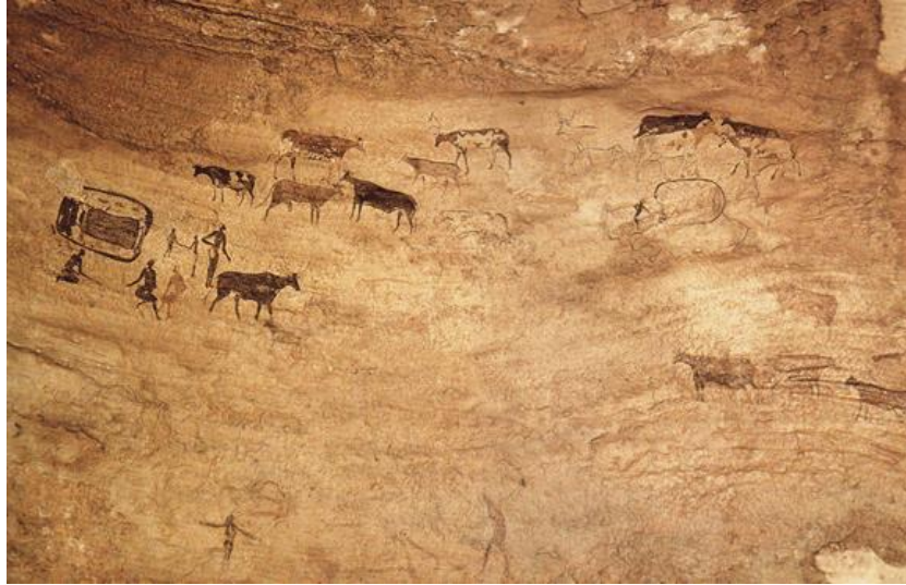
(Cattle being tended, Algeria, 5,000-2,000 BCE)

The earliest figures from Africa are cave paintings of animals. As the climates of regions such as the Sahara and Kalahari changed to be more arid, the types of animals changed as well. Around 8,000 BCE the Sahara was fertile grassland. At that time there was ample vegetation for the people to raise large herds of livestock. By 2500 BCE, this area was drying and by around 600 BCE images of camels appeared.