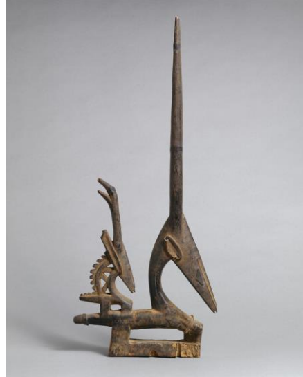
Bambara/Bamana Ci Wara , Mali, 19 th – early 20 th centuries

This antelope headpiece is from Mali. According to the mythology, the antelope taught humans agricultural practices.