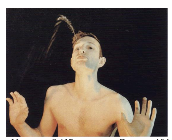
Bruce Naumann Self Portrait as a Fountain 1966-70

During the 1960s and 70s many artists decided to bypass the art critics, dealers, collectors and museums by creating art for a live audience. Performance Art facilitates a direct art experience and relationship between the performer and those watching the performance. As a temporal work that cannot be bought or owed, it denies the idea of art as something exclusively for the wealthy.