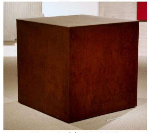
Tony Smith Die 1962

These artists wanted to create artworks that could be immediately understood by the general public without any background knowledge. The Minimalists rebelled against art for the elite.