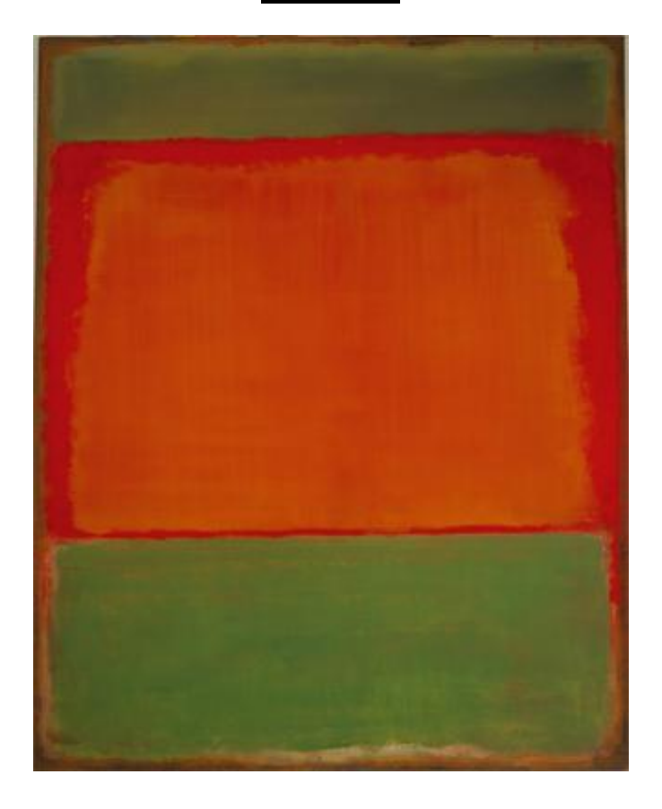
Mark Rothko Untitled 1949

Color Field painting is another type of Abstract Expressionism. This style gets its name from the large areas of flat or subtly blended colors. The emphasis is on experiencing the qualities of paint, such as color and fluidity, rather than the representation of space, photo-realistic details, or the telling of a story.