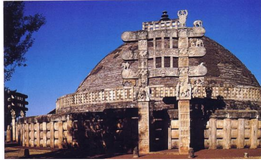
The Great Stupa, India, 100 BCE – 100 CE

South Asia is the birthplace of Hinduism and Buddhism. The Great Stupa is probably the most famous of all early Buddhist architecture. Stupas are hemispherical Buddhist structures that house relics. Most Stupas have at least one walkway that wraps around the outside. Followers of Buddha can demonstrate their reverence and respect by walking clockwise around the stupa.