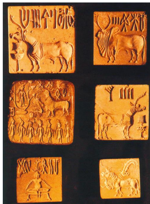
Indus Valley Seals, Pakistan 2500-1500 BCE

Many of the ideas people associate with Asia started in South Asia. This includes Hindu beliefs and Buddhism.