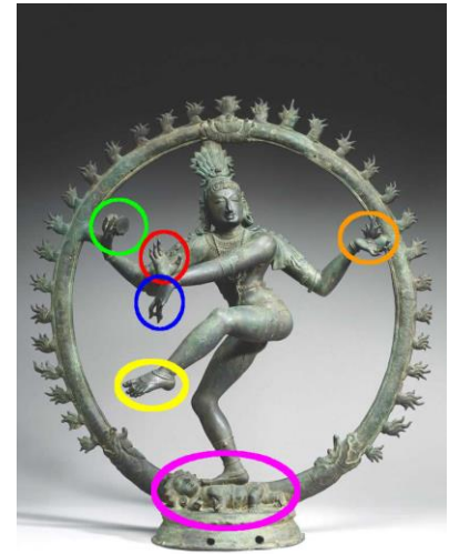
Shiva Nataraja: Lord of the Dance, Chola Period, 11th century

In Medieval India, the three main deities were Brahma, Vishnu, and Shiva. This figure of Shiva Nataraja, Lord of the Dance, is a version of one of Medieval India's most famous icons. This image, symbolizes the passage of time, creation, protection, destruction, release from destiny, and enlightenment.